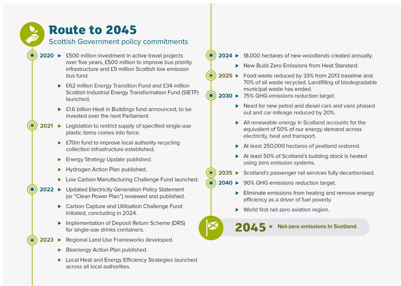
Figure 2.1 Route to 2045: Supporting the Green Economy and a Transition to Net Zero

The Scottish Programme for Government made a commitment to the development and publication of a CESAP ‘providing a framework for the skills investment needed to meet the climate change challenge and successfully support Scotland’s transition to a low carbon economy in a just and inclusive manner’. This underpins the Scottish Government’s policy directive to drive demand through investment in a range of measures to support the green economy and a transition to net zero, as set out in Figure 2.1.