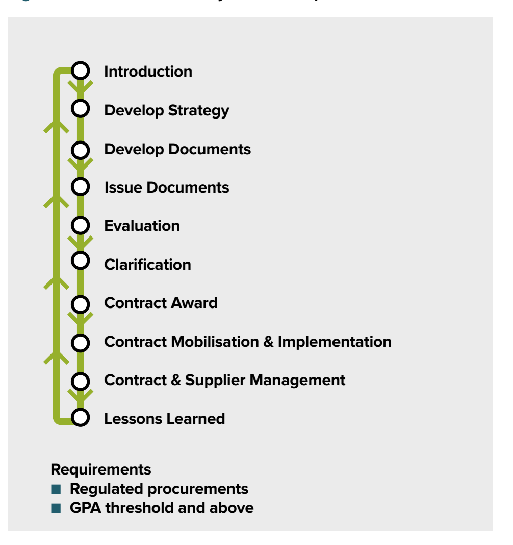
Figure 1 Procurement Journey Route 3 Requirements

The SDS central Procurement team works with internal customers to develop new contracts. We also conduct collaborative IT procurements for Scottish Enterprise, Highlands and Islands Enterprise and South of Scotland Enterprise, through the EIS Shared Service which is based on the Gartner Service Integration and Management model.