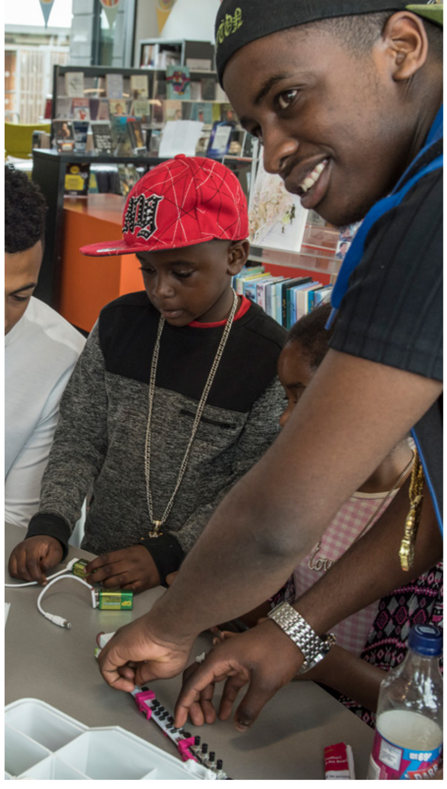
Digital Toybox event at Craigmillar Library, Edinburgh. The programme gives young people across Edinburgh the opportunity to develop computer science related digital skills.