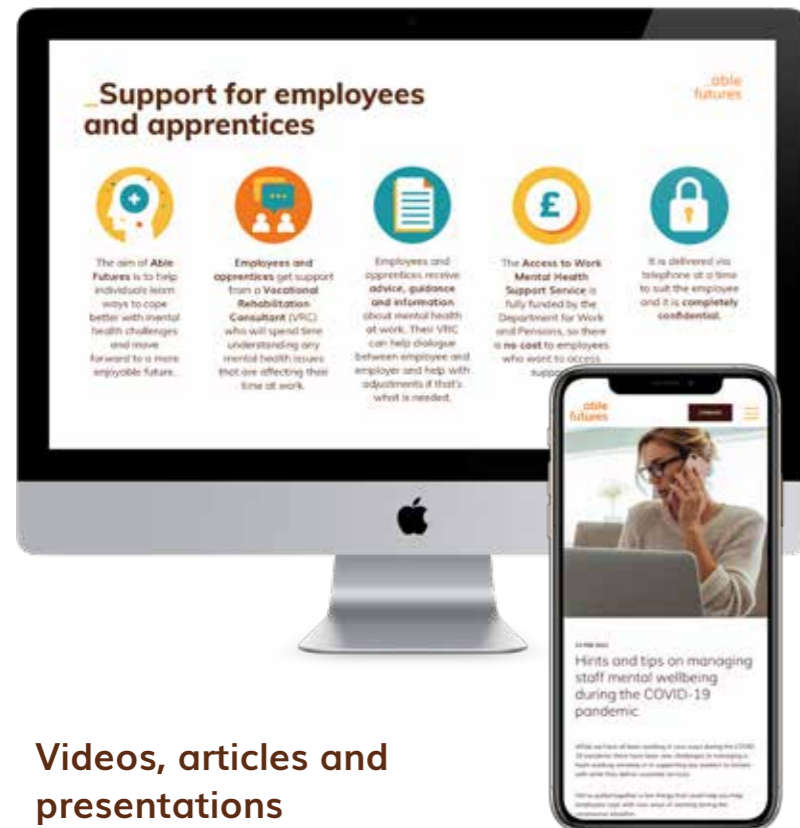
Videos, articles and presentations

Your local Business Account Manager will help you embed mental health awareness and support in your business by providing information sessions about the support Able Futures can provide and a suite of marketing materials available in English and Welsh language versions.