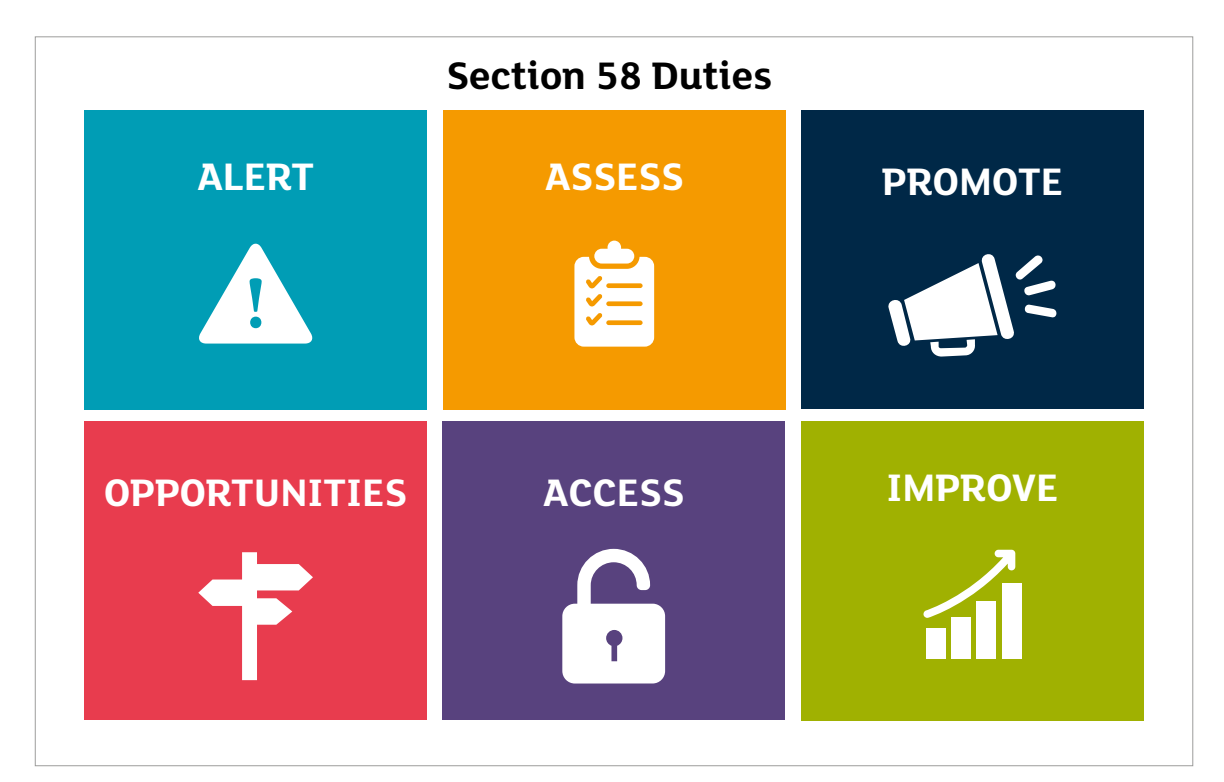
Figure 1: Section 58 Duties

Section 61 of The Act requires SDS as corporate parents, to report on its corporate parenting duties. This, SDS's second Corporate Parenting Plan, contains a formal report outlining progress against the commitments made in the 2015 – 2018 plan, as well as identifying further actions to be taken forward in 2018 – 2021.