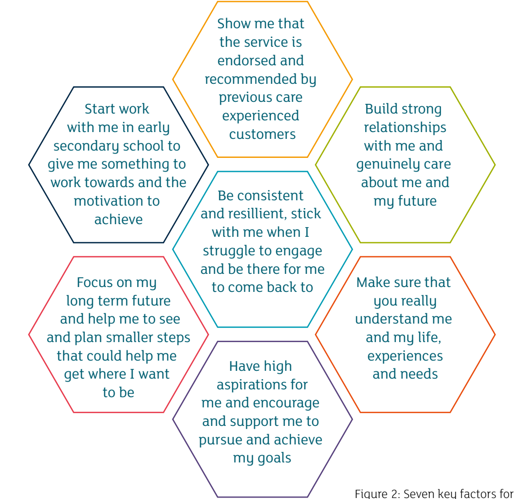
Figure 2: Seven key factors for service delivery identified by our care experienced customers

We also ran four workshops with internal colleagues to inform the development of this Plan. We held one with our Monitoring Group to assess achievement against the last plan, two with our Community of Practice to identify strengths and areas for improvement, and one with senior colleagues to identify potential actions based on the feedback of customers and colleagues.