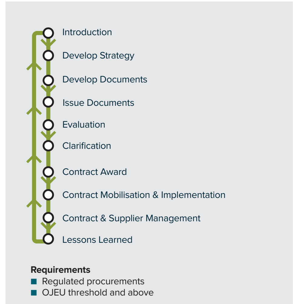
Figure 1 Route 3 Requirements

Our central Procurement team works with internal customers to develop new contracts. We also conduct collaborative IT procurements for Scottish Enterprise, Highlands and Islands Enterprise and South of Scotland Enterprise, through the EIS Shared Service which is based on the Gartner Service Integration and Management model.