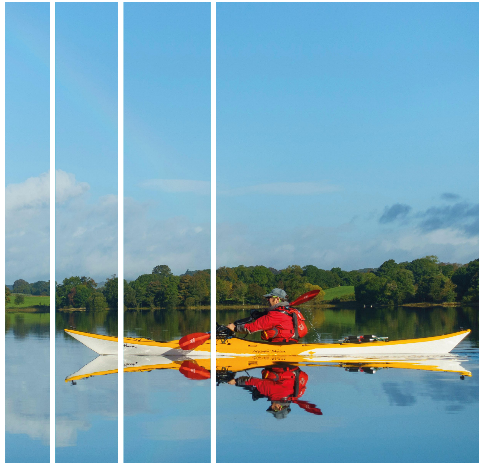
Availability of recreational and social opportunities are seen as key to encouraging people to stay in, or return to the region

Note: For a few organisations we engaged with more than one representative