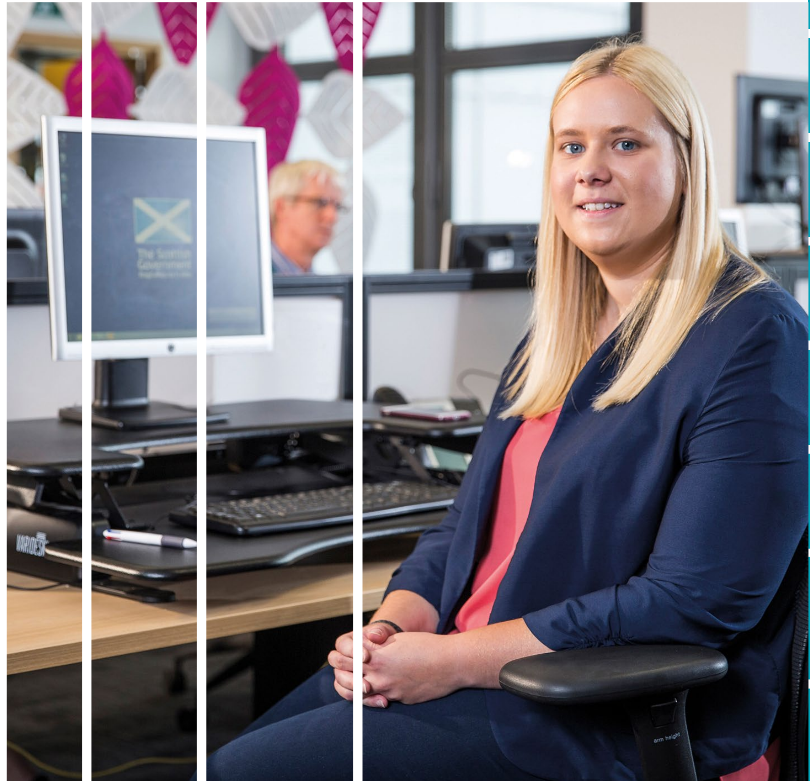
7% of residents travel to work in Edinburgh and the Lothians