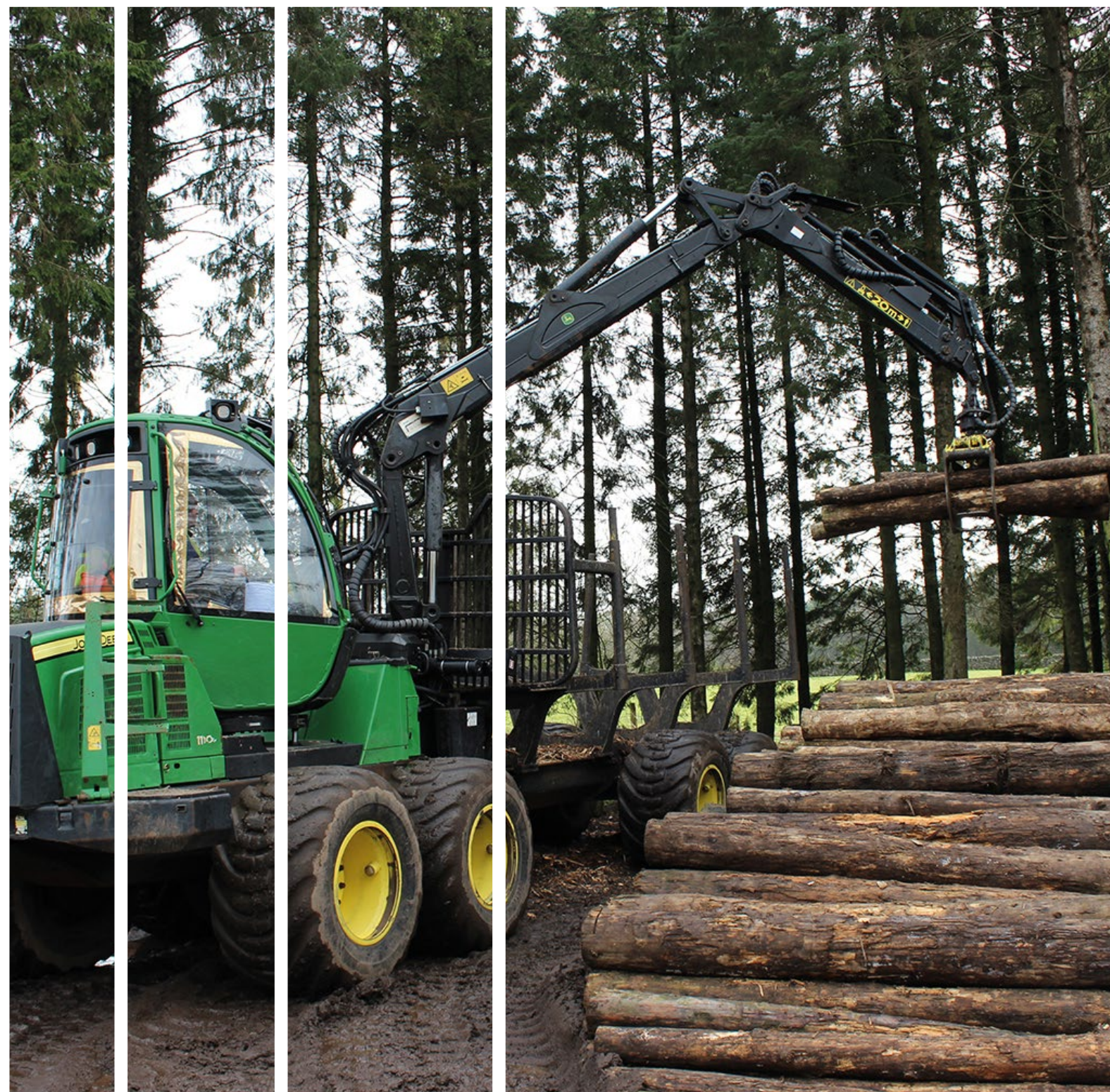
1.2% of the region's employers report skills shortages and hard to fill vacancies - higher than the national average

In developing this RSIP, it is crucially important to reflect the specific character and nature of the region, and consequently the research has been undertaken through a 'rural lens'. This perspective is based firmly on the data and evidence presented later in this report.