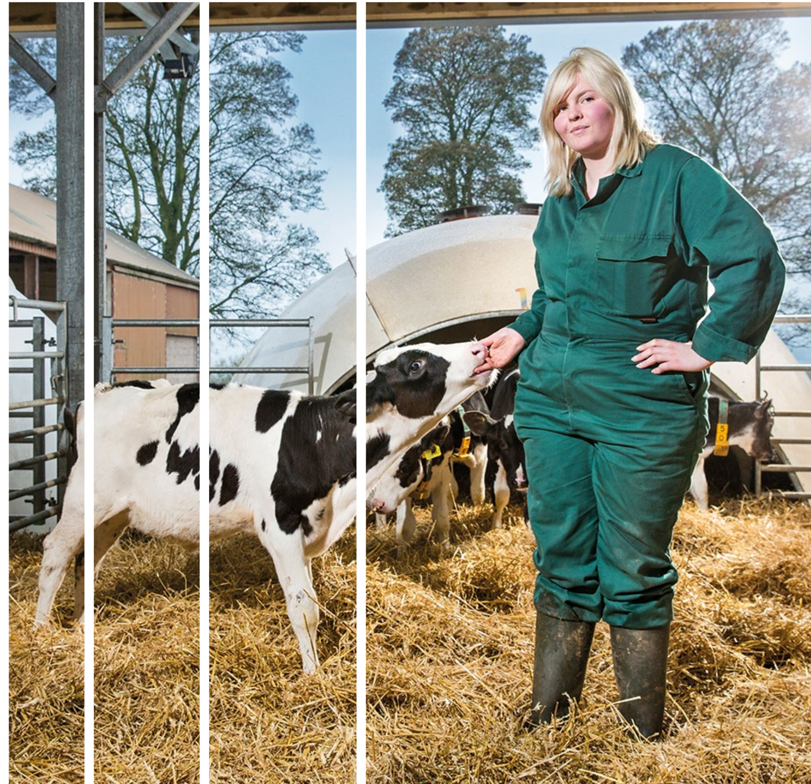
In 2017/18 there were a total of 1,379 Modern Apprenticeship starts in the south of Scotland