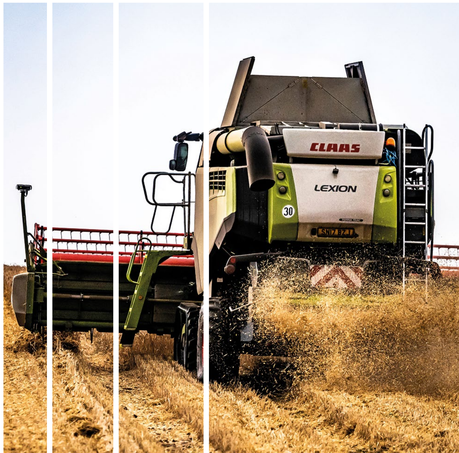
Agriculture, forestry and fishing supported 12,500 jobs in the region, with 7,900 job openings predicted in the next decade