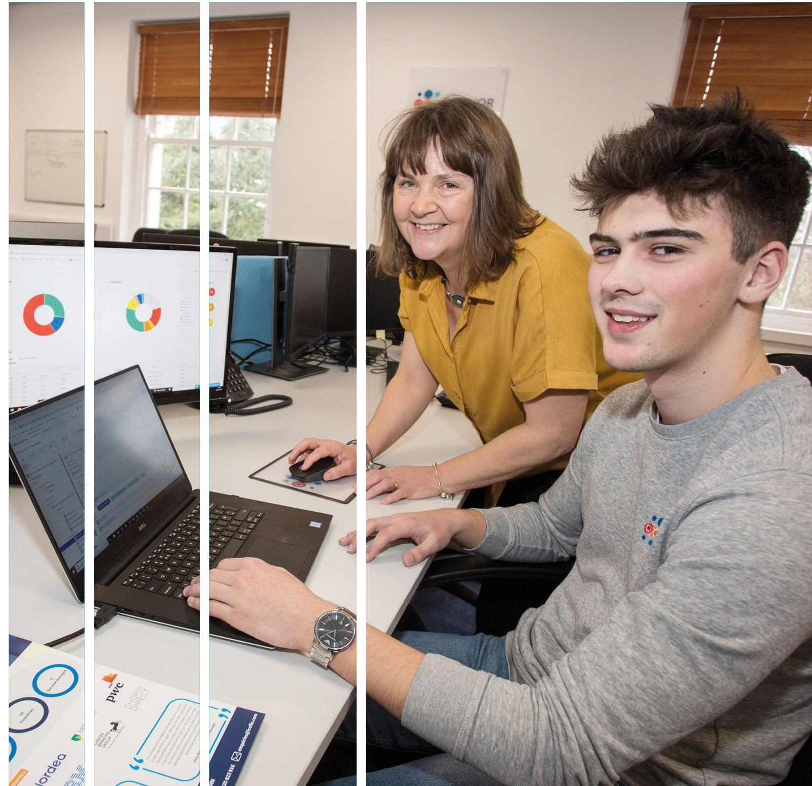
Increasing uptake of work-based learning - including Scottish Apprenticeships - will help to ensure young people stay in the region