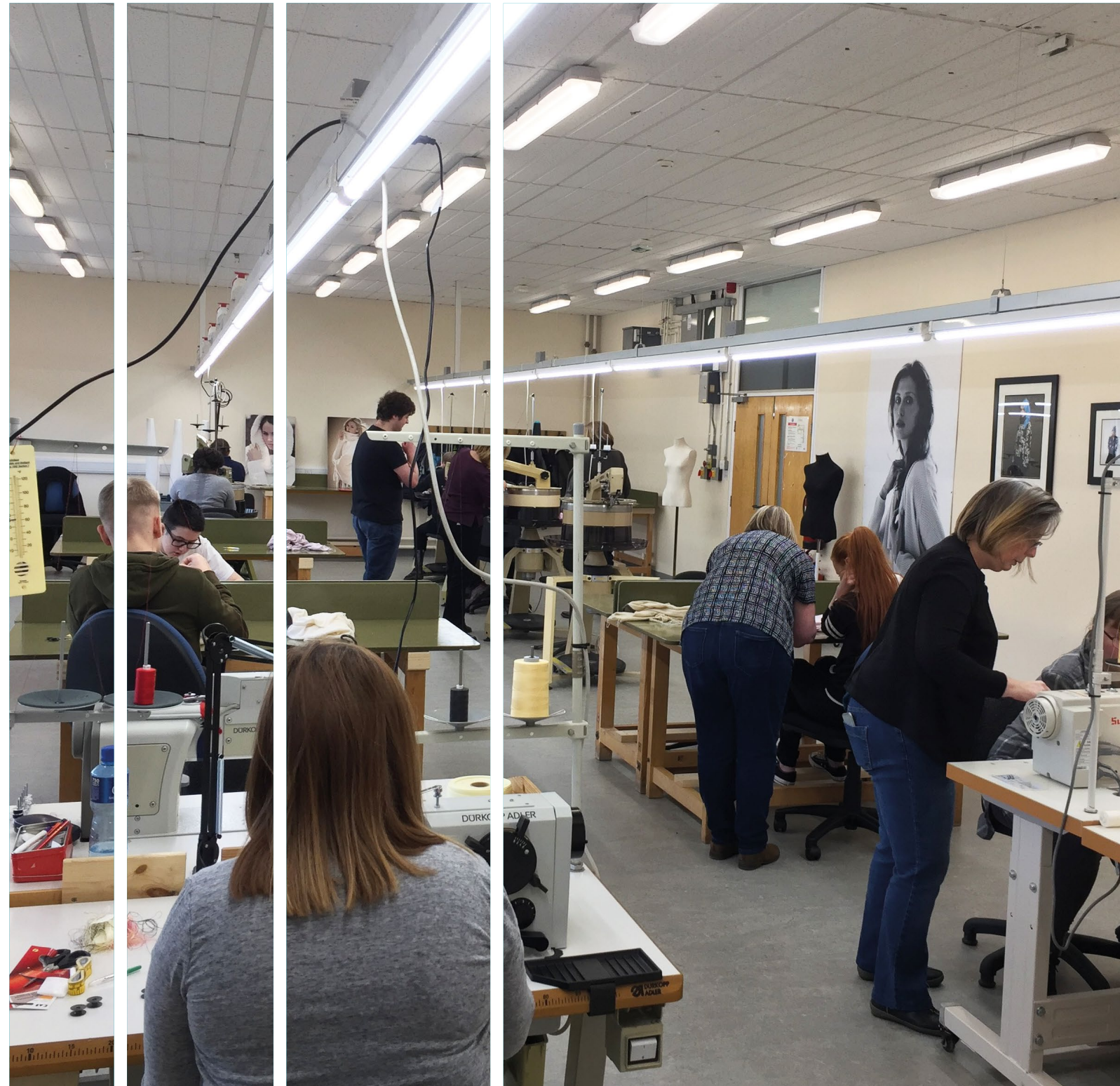
The south of Scotland enjoys a global reputation for its textiles and knitwear