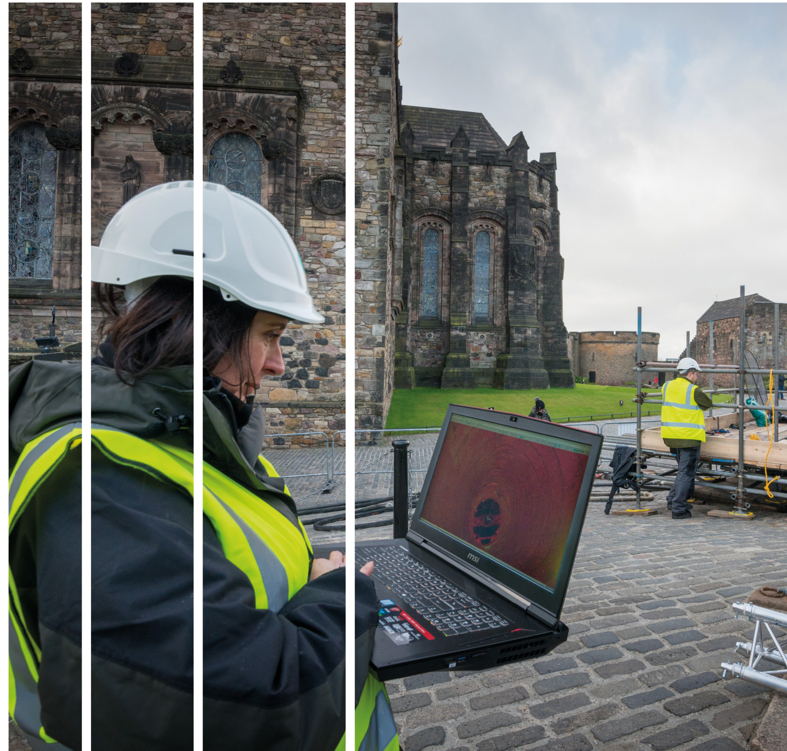
3D scanning of the Fore Well at Edinburgh Castle.

The Construction and Built Environment Graduate Apprenticeship (SCQF 10) would also be of relevance to those in the historic environment sector. Graduate Apprentices are employed and spend around 80% of their time in work and 20% at university or college. This integration of work and learning means that the work they carry out day-to-day counts towards their qualification.