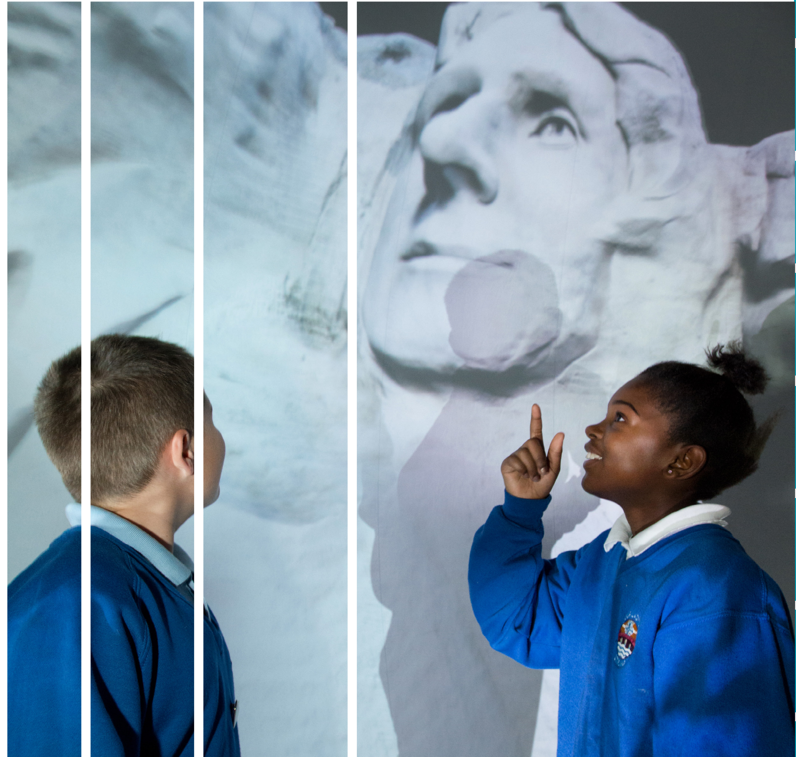
Primary school pupils attending Digifest 2018: History is your playground at the Engine Shed in Stirling.

There are reported to be at least 17,000 volunteers actively engaged in Scotland's historic environment sector. However, given the difficulty in defining and tracking those involved in this broad sector this figure is likely to significantly under-represent the true level of volunteering in the sector.