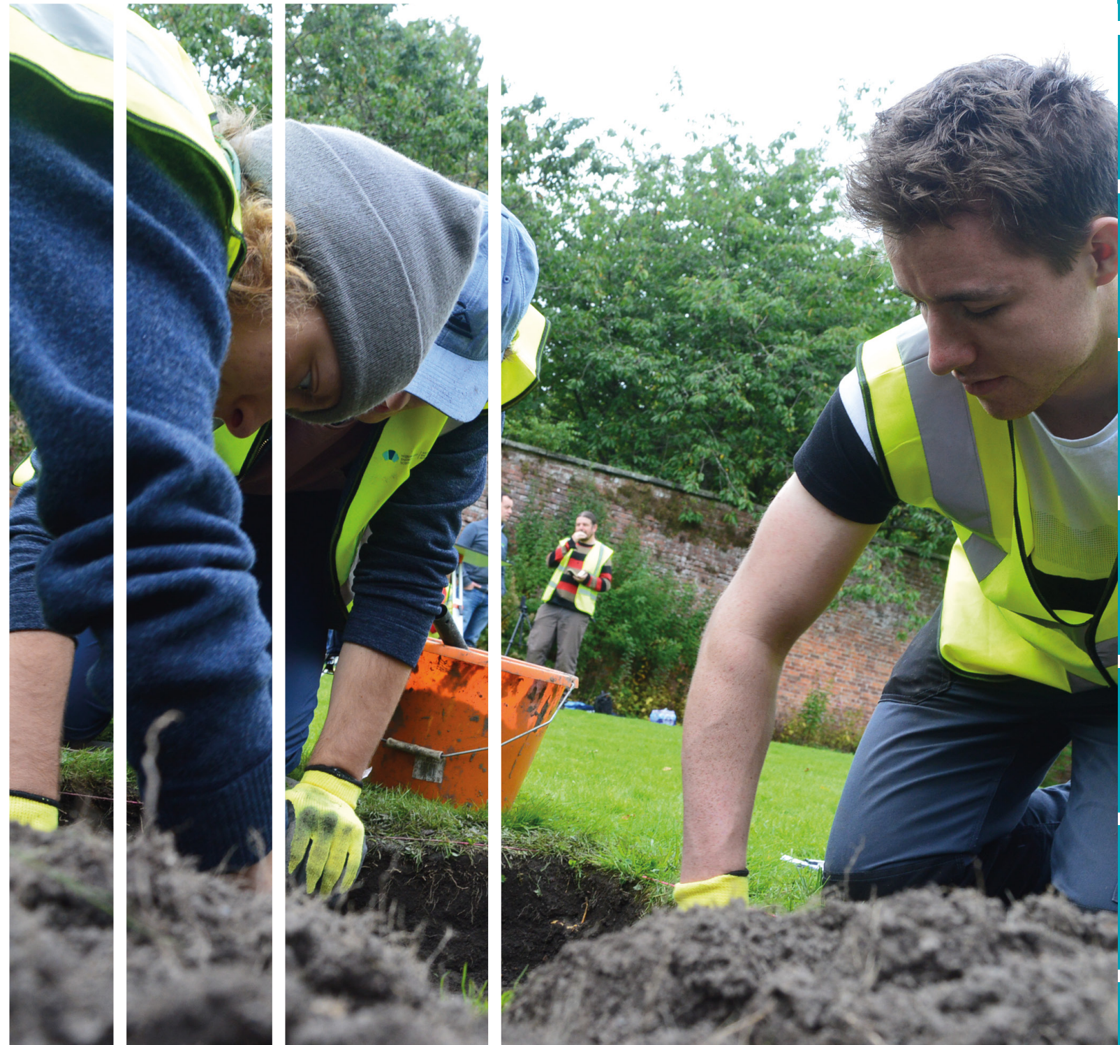
Archaeology and construction students at Dig It! Initiative, September 2017.

The Construction Scotland Innovation Centre also hosted an open discussion between the two sectors regarding innovative training provision. Building History involved a variety of construction and heritage partners, as well as Society of Antiquaries of Scotland, Archaeology Scotland, Forth Valley College, the University of Stirling and the Scottish Funding Council. In addition to providing free training and networking opportunities for students, Building History created a network of organisations who bought into a core concept and delivered a pilot project to explore its potential.